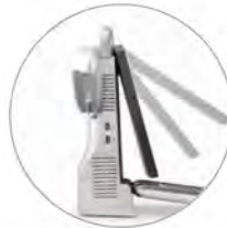
60 degree tilting angle adjustable monitor