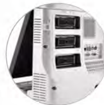
Max 3 universal transducer connectors