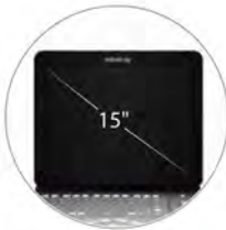
15 inch Full Screen design