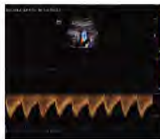
PW of Umbilical Artery